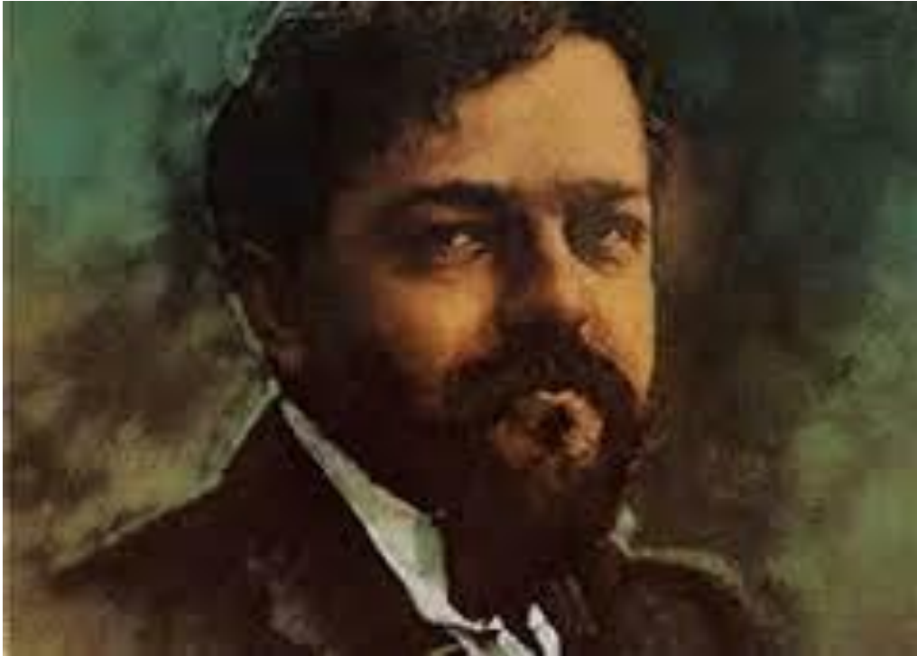
CLAUDE DEBUSSY (1862 – 1918)